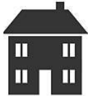
Health and Wellbeing