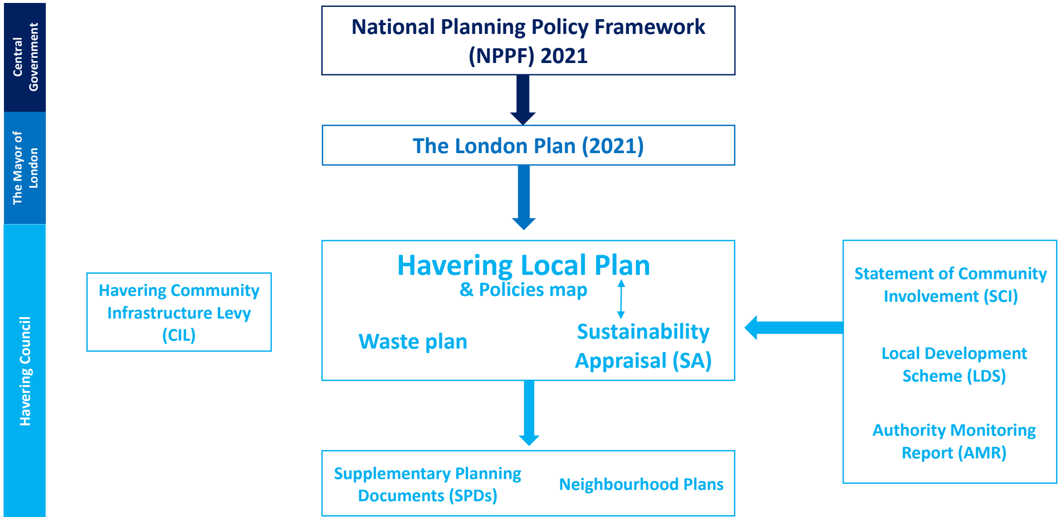
Figure 1: Hierarchy of planning documents