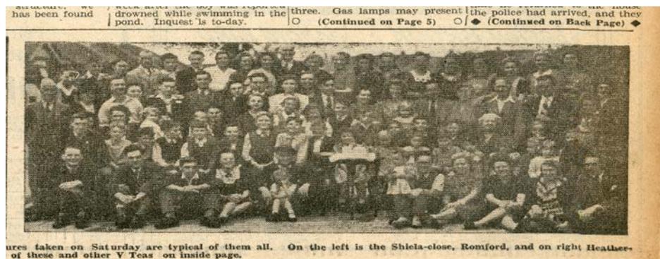
Picture from the Romford Times, 29 th August 1945, featuring A street party to mark VJ Day in Heather Close

Since traditional celebrations were not possible, Havering commemorated the day online with stories, photos, and messages of thanks to mark the significance of the day.