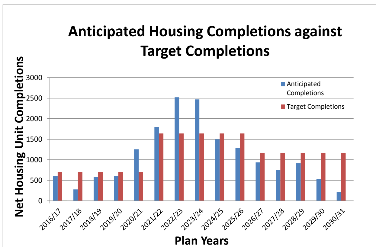
Table 5.2: Anticipated housing completions compared with target completions